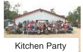
Kitchen Party 'family'

We were able to work some time into the schedule to attend a couple of nights at the Kenossee Lake Kitchen Party – awesome performances. One can't help noticing the feeling of FAMILY there – the farewells on the last day must show emotions!