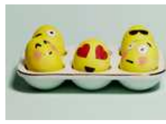
Emoji Easter Eggs