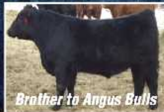
Brother to Angus Bulls

Bulls for Sale by Private Treaty (Black Angus & Charolais)