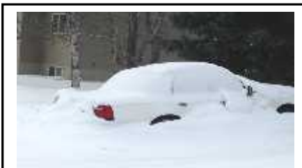
We hope the Murray family do not want to use this car till spring!