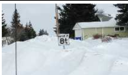
At the corner of Railway & Hall does this sign mean 8 tons of snow are piled up here??