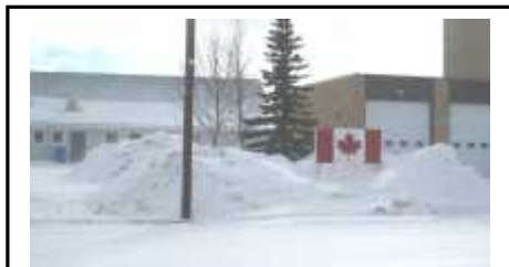
The Canada Flag peeks out from the snowbanks on the corner of Railway & Main.

And speaking of Winter ... we decided to take a tour of the Town to snap a few photos. It is getting more difficult with each snowfall for the Town Maintenance Men to find a spot to dump the snow!!