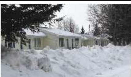
Those residing in the low rental units on Railway Avenue, we are sure will prefer to use their back doors to get out.