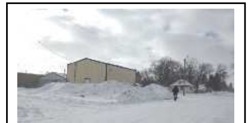
A resident walking past the Car Wash is dwarfed by the snowbanks.