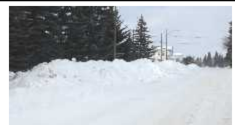
A "wall" of snow as you drive into town from Hwy #48 turning onto 1 st Avenue